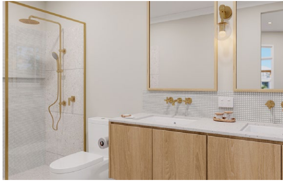
Interior images indicative only.